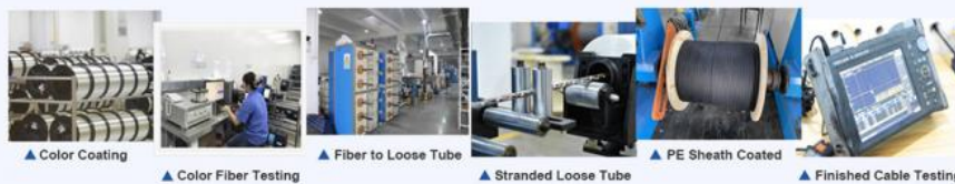
▲ Color Coating