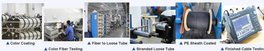
▲ Color Coating