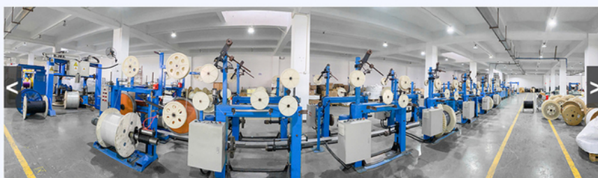
▲ Finished Cable Testing