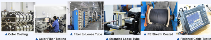
▲ Color Coating