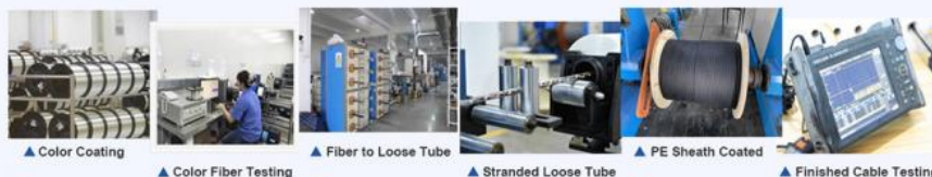
▲ Color Coating