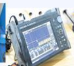
▲ Finished Cable Testing