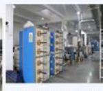
▲ Fiber to Loose Tube