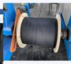
▲ PE Sheath Coated