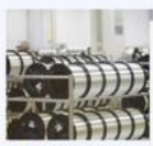
▲ Color Coating