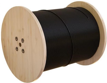
03 2km, 3km or 4km per drum Strong wood drumsealed with wood bars