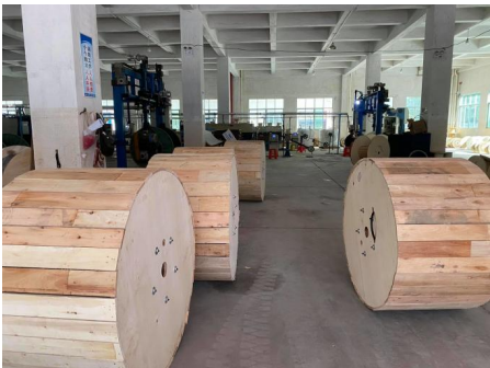
04 Wooden barrel packaging, can be customized, using high-quality raw materials for transportation