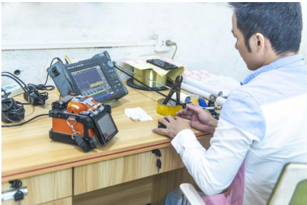
02 Attenuation test for each fiber by OTDR after production,and QC for every detail