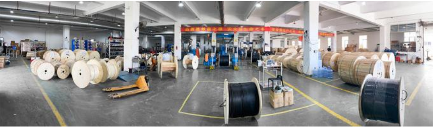
01 Standard production Line,strict SOP production procedure

The outer sheath is low smoke, halogen-free, and flame-retardant.