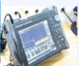
▲ Finished Cable Testing