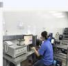
▲ Color Fiber Testing