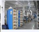
▲ Fiber to Loose Tube