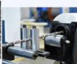
▲ Stranded Loose Tube