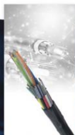
AIR BLOW CABLE