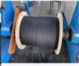
▲ PE Sheath Coated