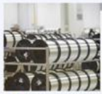
▲ Color Coating