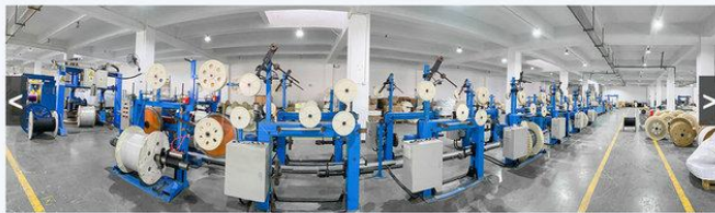
▲ Finished Cable Testing